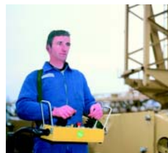
Public works cranes