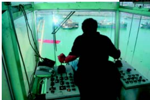
Overhead travelling cranes